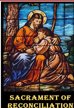
SACRAMENT OF RECONCILIATION

Jesus said, "Let the little children come to me, and do not hinder them, for the kingdom of heaven belongs to such as these." Matthew 19:14